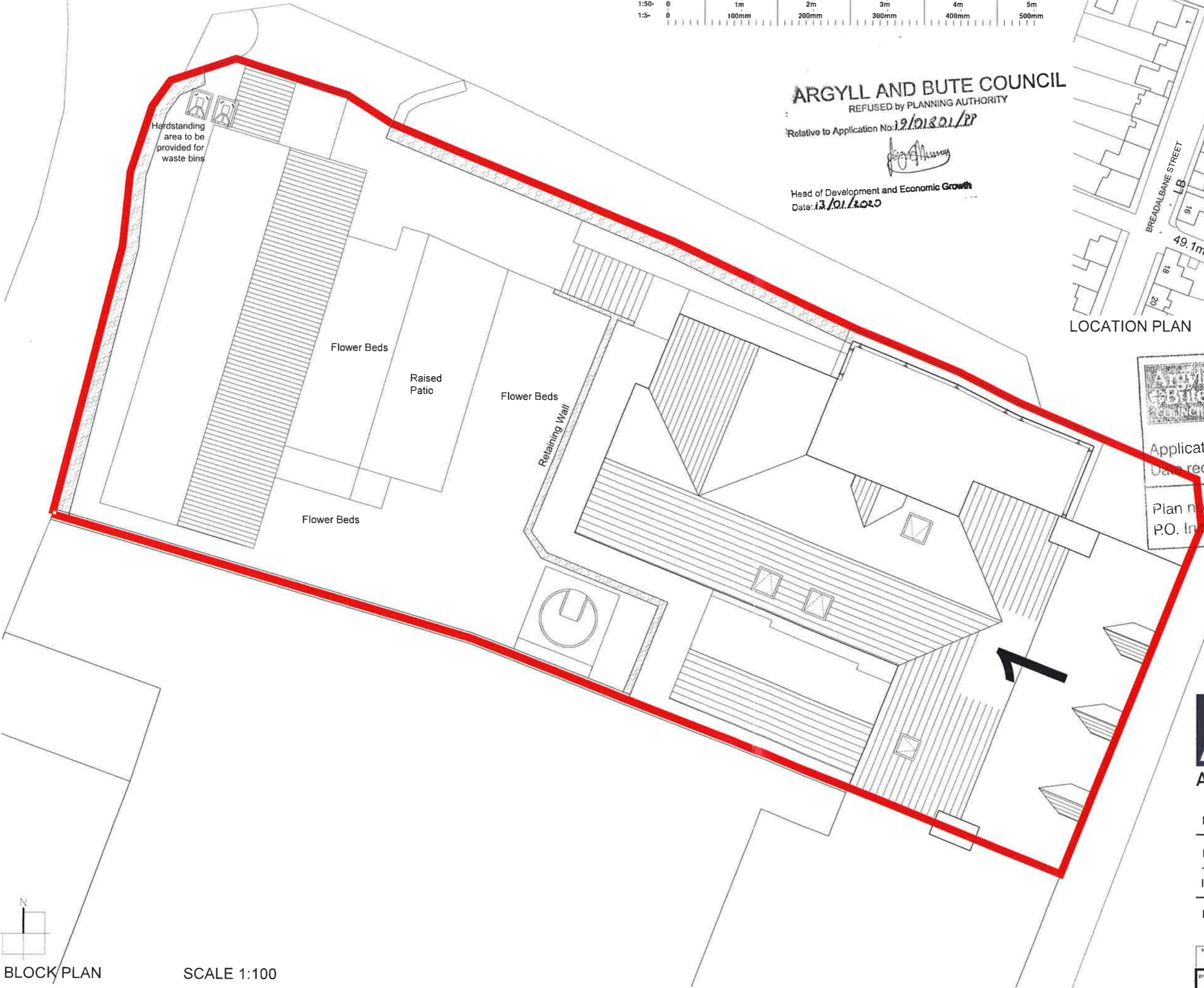
BLOCK PLAN SCALE 1:100

AGL ARCHITECT Architecture | Planning | Project Management 32 Carseview Bannockburn Stirling FK7 8LQ Tel: 01786 811533. Mob: 07814 139 222 E-mail: info@aglarchitect.co.uk Web: www.aglarchitect.co.uk